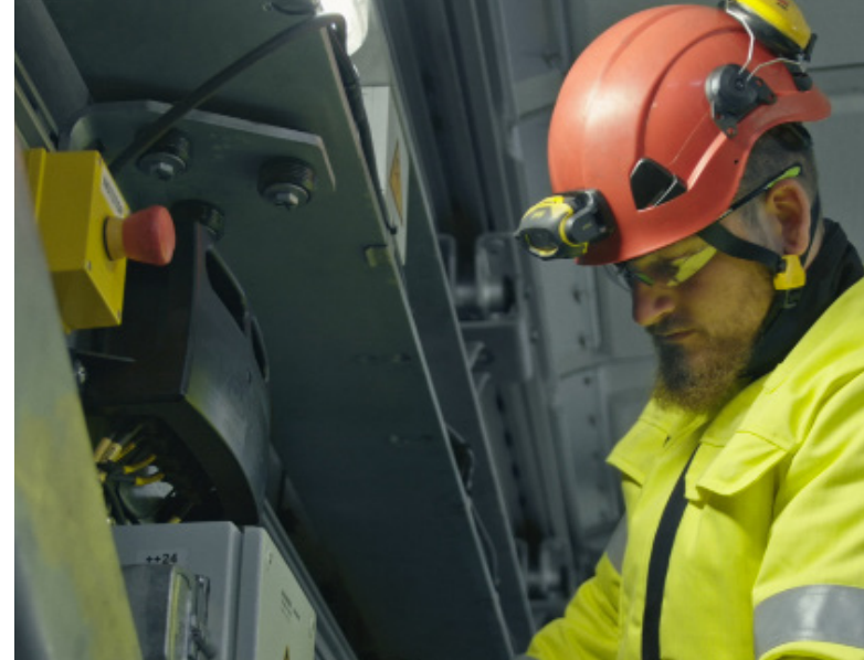
SERVICE & MAINTENANCE

„Besides offering great service our fast supply chain and huge spare parts inventory ensure that you are in good hands.“