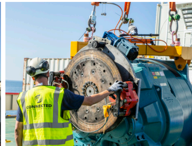
COMPONENTS & SPARE PARTS